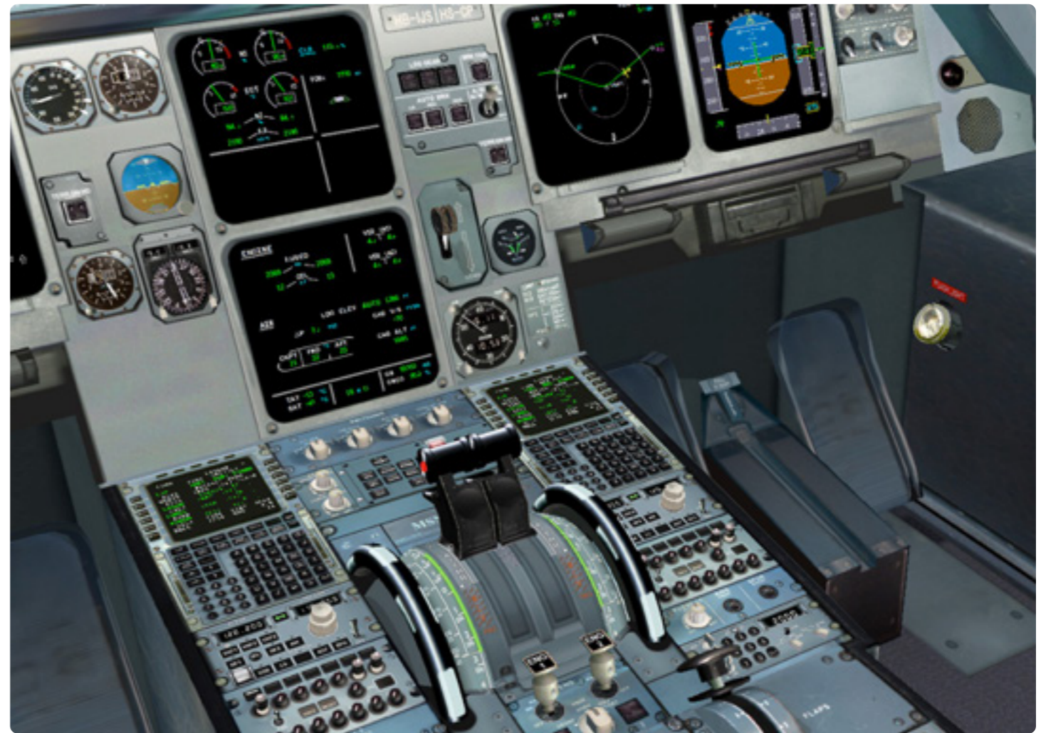
Center Pedestal looking to the right